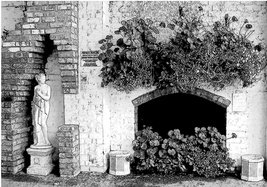
Bottling Works Spring

The original source of the spring was established in 1850 and continued in production until 1950. The Burrow brothers bottled the spring water and supplied such notables as King George V and VI, the Duke of Bedford, Duke of Wellington, Sir Oswald Mosley, Charles Darwin, Stanley Baldwin (Conservative Prime Minister for three terms of office) and the Liberal Prime Minister Herbert Asquith. The flow of water today is a mere trickle of its former glory.