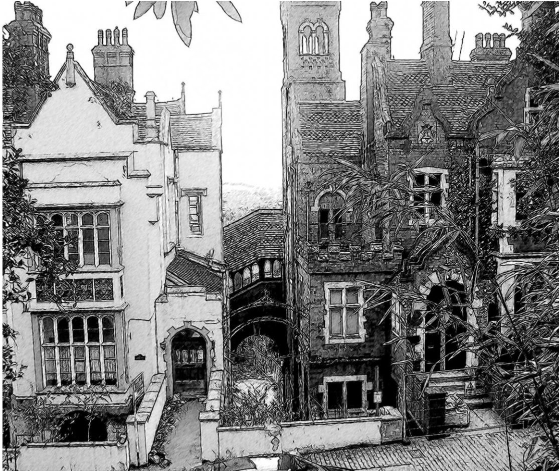
Bridge of Sighs